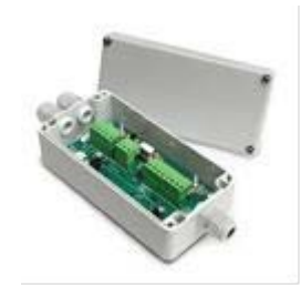
DSJ1 & 4 Strain gauge data converter to RS232. Modbus, CAN, RS485 available as single or 4 channel IP65 enclosure

DSC Card version available the strain gauge data converter to RS232. Modbus, CAN, RS485