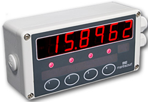
Data input display for digital load cells and wireless