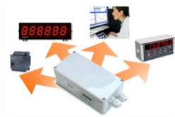
T24-SO Radio telemetry input, data output for displays and printers