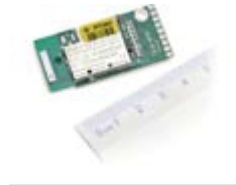
T24-SA Acquisition Module Strain gauge to radio telemetry converter