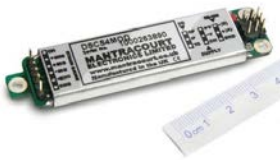
DSC Strain gauge data converter to RS232, Modbus, CAN, RS485