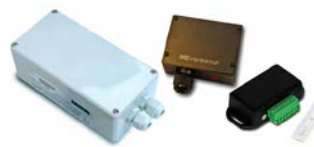
T24 Acquisition Module Enclosures Strain gauge to radio telemetry converter